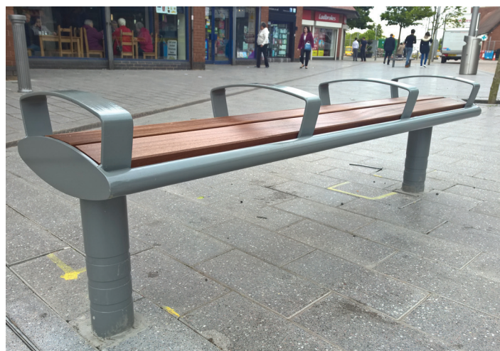
Image shows Wessex Bench in RAL 9007, Below Ground Fix, with optional arm rests